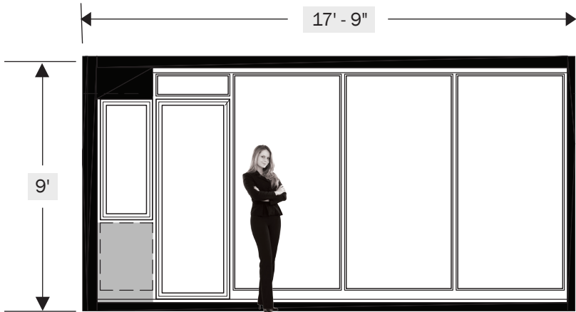
162 SQ. FT. WINDOW ELEVATION AS VIEWED FROM LIVING AREA AND KITCHEN

SOHO FLOOR-TO-CEILING AND WALL-TO-WALL WINDOWS® MAXIMIZES NATURAL LIGHT AND VIEWS